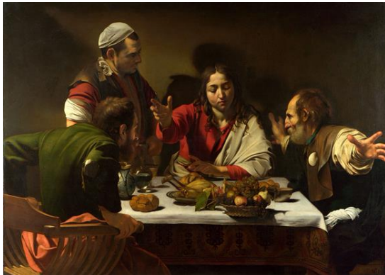
The Supper at Emmaus, by Caravaggio

Our online service for this Sunday, 26 th April included the Gospel reading of the disciples' walk to Emmaus. The link for the service is here .